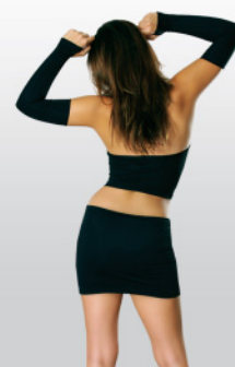
3007 Long mittens. 80% polyamide 20% elasthan. 3015 Top with straps over the neck. 80% polyamide 20% elasthan. 3071 Provocative mini-skirt. 80% polyamide 20% elasthan.