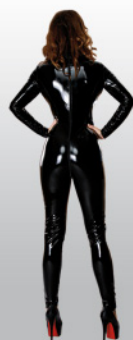
1017 Catsuit with collar and long sleeves. Zipper in front. PU: 36% polyurethane 56% polyamide 8% elasthan.