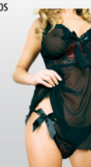
7005 Babydoll with lacy finishing. Nice ribbon between the cups. Matching G-string.