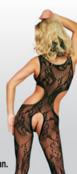
7013 Crotchless black lace catsuit with a sexy cut-out in the back and on the sides. 92% polyamide 8% elasthan.