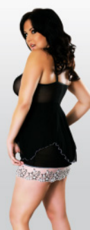
7029 Beautiful babydoll, lacy neckline and the bottom with floral theme. Matching T-back string. 94% polyamide 6% elasthan.