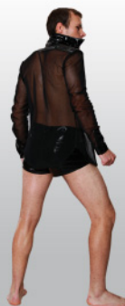
1788 Shirt with long sleeves made of net fabric. PU: 36% polyurethane 56% polyamide 8% elasthan. 1806 Male shorts. PU: 36% polyurethane 56% polyamide 8% elasthan.