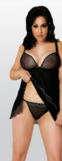
7031 Black babydoll made of very soft and little transparent fabric will emphasize values of your body. 93% polyamide 7% elasthan.