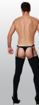
1775 Male string with 4 suspenders. PU: 36% polyurethane 56% polyamide 8% elasthan.