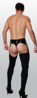
1786 Garter belt style male slips with 2 suspenders. Male short with cock-bag in front. PU: 36% polyurethane 56% polyamide 8% elasthan.