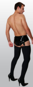
1776 Male shorts with 4 suspenders. PU: 36% polyurethane 56% polyamide 8% elasthan.