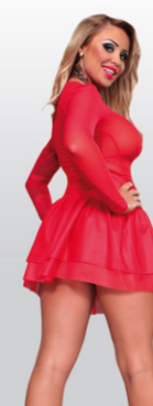
3232 Cute frilly dress with long sleeves made of elastic tulle. Tulle: 86.5% polyamide 13.5% elasthan