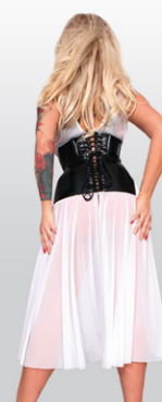
9129 Sexy dress combined with Datex and delicate mesh. Datex: 69% natural latex 27% polyamide 4% elasthan. Tulle: 86.5% polyamide 13.5% elasthan