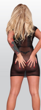
3231 Hot and transparent dress made of elastic tulle. Tulle: 86.5% polyamide 13.5% elasthan