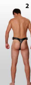
2 738 Male strings with cut in front made of split leather (2,1-2,3mm).