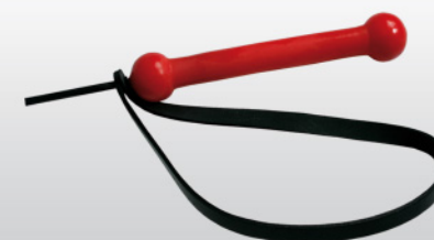
Holder with leather strap.