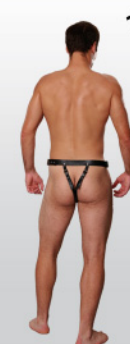
1 5704 V-back male string made of split leather (2,1-2,3mm).